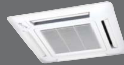
Compact Cassettes (AAU Models)