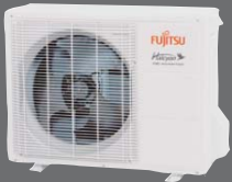
Outdoor Models (AOU Models)

Rebates of up to $1,500 are available for Massachusetts residents when purchasing a high efficiency ductless mini-split heat pump.