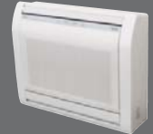
Floor Mounts (AGU Models)